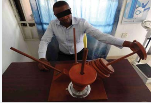
Figure 6: The left upper limb moves into abduction by moving the wooden circular plates to the left wooden pole (b).