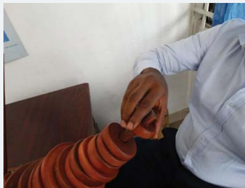
Figure 9: The inter-phalangeal joints go into flexion.