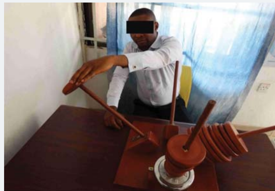
Figure 5: In a sitting position, the left upper limb moves into adduction by moving the wooden circular plates to the right pole (a).