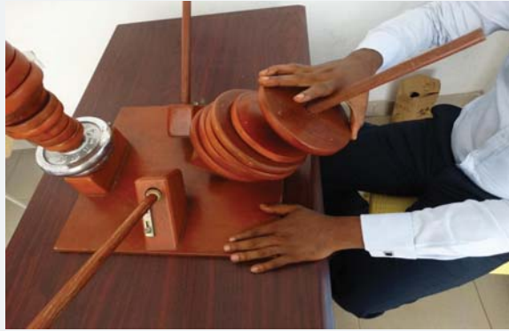
Figure 10: The inter-phalangeal joints go into extension.