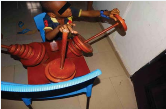
Figure 12: A Cerebral Palsy child in a Rehabilitation class using Dominic's Board.