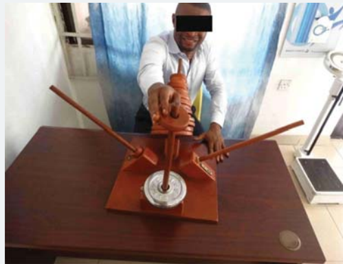
Figure 7: The right upper limb moves into extension by moving the wooden circular plates to the distal wooden pole (c).