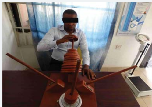
Figure 8: The right upper limb moves into retraction as well as elbow flexion by moving the wooden circular plates to the proximal pole (d).