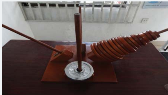
Figure 11: A complete Dominic's Physical Rehabilitation Board consisting of a wooden square board measuring 16 by 16 inches on the sides and 0.5 inch in thickness.