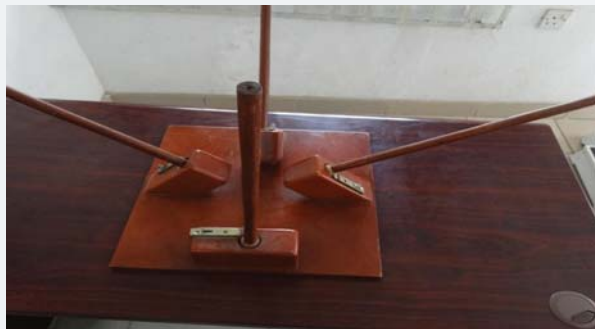
Figure 3: Four wooden poles, each having a length of 18 inches and a base of 3 inches that normally fit into the hole on the wooden block.