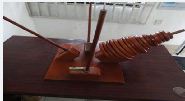
Figure 4: Eighteen pieces of circular wooden plates, ranging from 1.5 inches to 7.0 inches in diameter with a thickness of 0.5 inch.