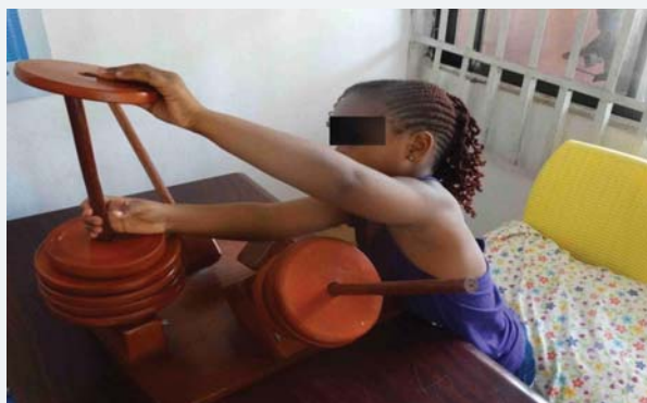
Figure 13: A Child with left Shoulder injury using Dominic's Physical Rehabilitation Board during her rehabilitation phase.