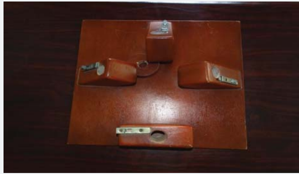
Figure 2: A square board measuring 16 by 16 inches in length and width with 4 wooden blocks placed on each of the four sides. Each of the four wooden blocks has a hole in the upper one third that bears a wooden pole. Each of the wooden blocks is inclined at 60° to the floor of the wooden square.