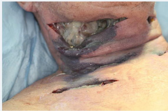
Figure 3: Second day after incisions.

The wounds were taken care of daily, necrectomies were made, and the irrigation was done while patient was sedated, due to the pain. The cleansing of the wounds took about 2 weeks, the patient was in a moderately serious condition. Clinically intoxication with subfebrile temperature was noted, changes in the blood tests: ESR 40mm/h, WBC12, 7H103/mm 3 , RBC-3.55L 10mm 3 . HGB-10,6L g/dl, hematocrit-32.2L%, Neutrophyls-60, Meta 1, Micro+, Lymphocytes-4, Aniso+. Microbiological tests results from the incision wounds- E. coli 100 million colonies per ml, Enterococcus sp. 500000 colonies per ml. Hafnia alvei 5 million per ml. Staphylococcus coagulase negative 1000 colonies per ml. Candida. Enterococcus sensitive to Ampicillin, Hernia sensitive to Ciproflexane, E. Colli sensitive to Ampicillin. All were sensitive to Gentamycin. Fluconazole, Apimicillin, Gentamicin and Ceftriaxon was prescribed. On the 14th day after the surgery the overall condition of the patient was severe. Patient had pain, temperature up to 38.6C. Swelling appeared locally on the right upper third of the anterior thoracic wall, while palpating the tissues crepitation was felt. During an i/v narcosis, incision was made in the swollen region, purulent discharge was released, the wound was irrigated and drainage was placed (Figure 4).