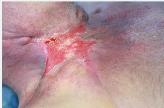
Figure 5: The wound at the moment the patient left the hospital.

Even though necrotizing fasciitis is a rare condition (up to 2,6% of all infections in the head and neck region), dentists, ENT-doctors, maxillofacial surgeons, need to be