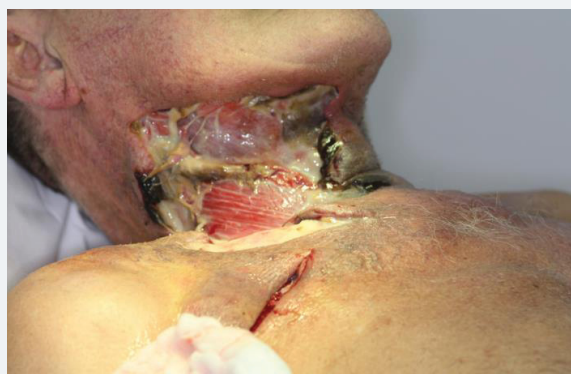
Figure 4: Patient two days after the incision in the thoracic area.