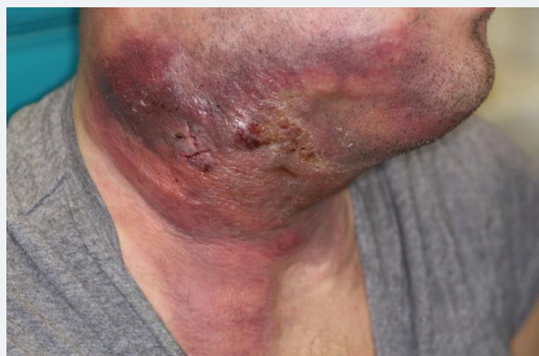
Figure 2: Patient 5 days after cystectomy.

Temperature 37.5C. Blood tests showed erythrocyte sedimentation rate of 40mm/h, Leukocytes 17.7 \times 10^3/\text{mm}^3 , Erythrocytes- 3,55 \times 10^{12}/\text{L} , Hemoglobin 11,3g/dl, hematocrit 32.2%, Neutrophil 60, Meta 1, Micro+, Lymphocytes 4, Aniso+. CRP 162mg/l, bicarbonate 134.6mmol/l. taking the clinical and blood tests in account, a new diagnosis was set- cellulitis. Extra USG was made for the neck. In the USG- on the right anterior side of the neck from submandibular to clavicular region- multiple small dense formations were seen, that were more or less mobile. The USG results fit the diagnosis of cellulitis of the neck. During general anesthesia 3 horizontal incisions were made on the right side and 2 horizontal incisions were made on the left side of the neck. A purulent, necrotic discharge was released from the wound, the material was sent for microbiological examination, the wound was irrigated with chlorhexidine solution and five drainages were placed. The patient was moved to the intensive