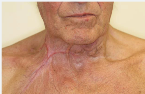
Figure 6: Three months after patient was released from the hospital.