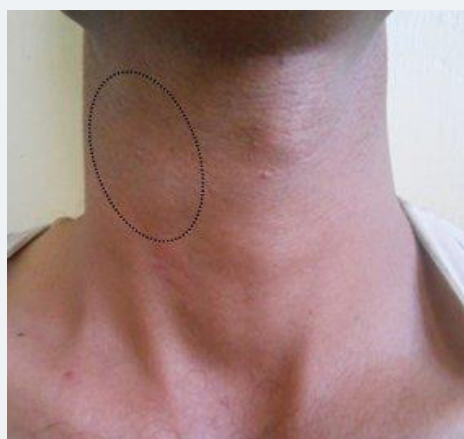
Figure 1: Swelling anterior triangle of neck on right side extending from mandible to inferior border of thyroid cartilage.

Contrast Enhanced Computed Tomography(CECT) scan was done which showed a well-defined cystic fluid attenuation lesion in relation to carotid sheath extending from C3-C6 level, with thick peripheral contrast enhancement and bulging medially into right hypo pharynx pushing right pyriform sinus interiorly figure 3. Marked confluent oedematous changes along adjacent subcutaneous tissues of neck were observed. No inferior extension into the mediastinum was found; neither any significant cervical