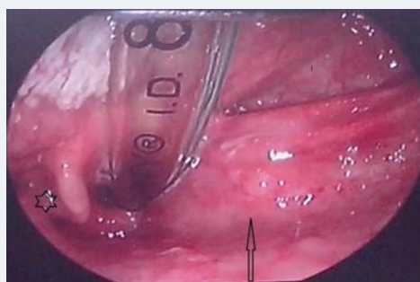
Figure 2: Flexible laryngoscopic picture showing obliterated right pyriform fossa (arrow) and normal left pyriform fossa (star).