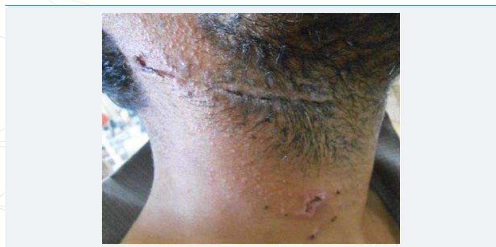
Figure 5: Follow up picture showing healed skin incision.