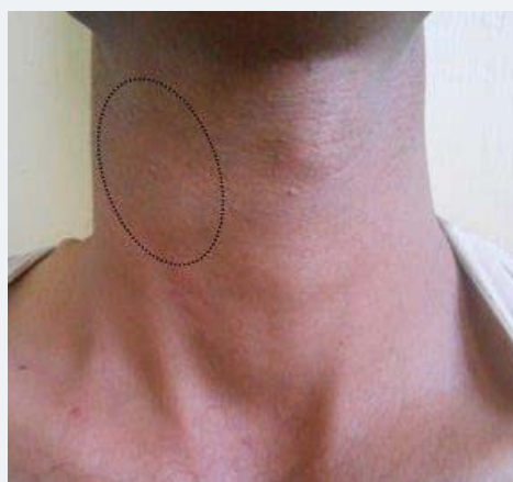
Figure 1: Swelling anterior triangle of neck on right side extending from mandible to inferior border of thyroid cartilage.

Contrast Enhanced Computed Tomography(CECT) scan was done which showed a well-defined cystic fluid attenuation lesion in relation to carotid sheath extending from C3-C6 level, with thick peripheral contrast enhancement and bulging medially into right hypo pharynx pushing right pyriform sinus interiorly figure 3. Marked confluent oedematous changes along adjacent subcutaneous tissues of neck were observed. No inferior extension into the mediastinum was found; neither any significant cervical