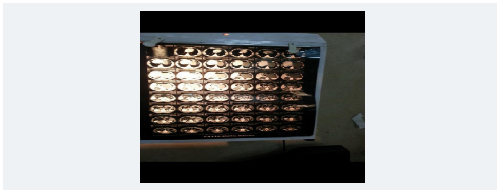
Figure 6: The CT scan showing right adrenal mass.