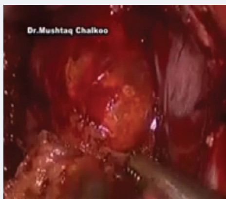
Figure 2: The lateral, inferior dissection done.