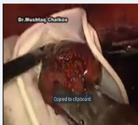
Figure 4: The encapsulated tumour.