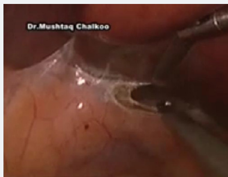
Figure 1: The posterior peritoneum abutting liver cut.

The inferior adrenal gland and periadrenal tissue is retracted laterally with the PEER retractor, as the medial dissection is performed in a cephalad direction (Figure 3). The dissection proceeds superiorly just lateral to the cava until the short right