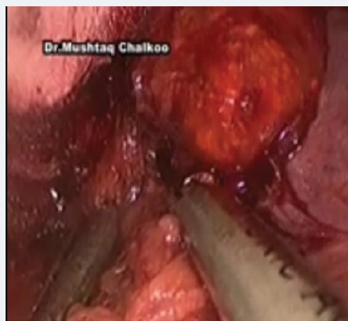
Figure 3: Posteromedial dissection.

adrenal vein is identified its divided. Dissection of the gland is subsequently carried out with care taken at the medial aspect where the wall of the IVC closely approximates the adrenal. The adrenal may extend posterior to the cava and this dissection is completed by following the wall of the cava and gentle medial retraction of the IVC. Once the medial dissection is completed, the lateral dissection is performed just as described for the left adrenalectomy. Once complete mobilization is accomplished and hemostasis is achieved, the specimen is removed with the EndoPouch (Figures 4,5 and 6).